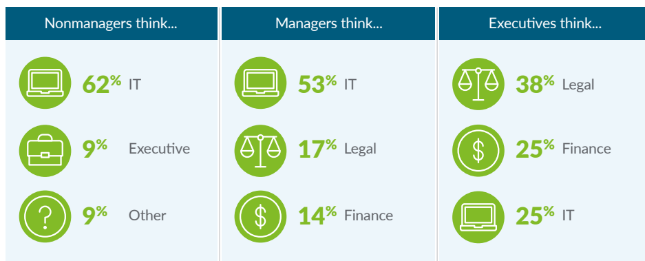
Figure 2: Who Is Responsible for Managing Documents?

ASUG research captures a unique view of what SAP customers are doing, thinking, and planning for the future. We apply traditional quantitative and qualitative methodologies and research best practices to deliver insights on relevant technology topics.