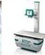
Veterinary Equipment Leasing