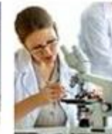
Veterinary Repair Center