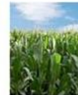
Technologies