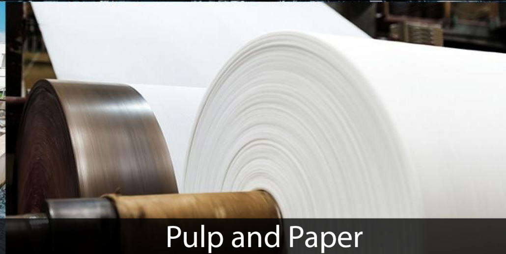
Pulp and Paper

Serving all Process Industries across Western Canada