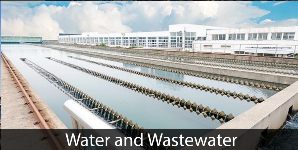
Water and Wastewater