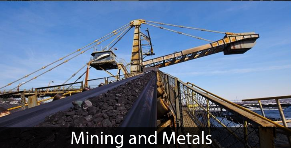
Mining and Metals