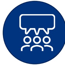
Diversity and Inclusion