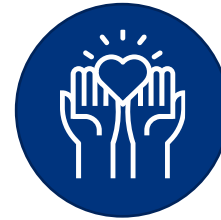
Technology to help prevent bias in the workplace